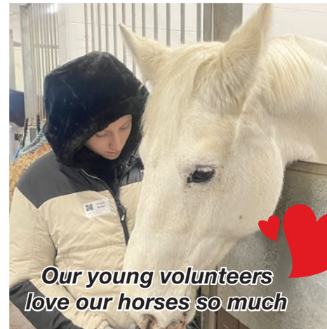
Our young volunteers love our horses so much

Taking a break from the equestrian world enabled me to re-examine my attitude to horses and leadership more broadly. It's been confronting, uncomfortable and exhausting at times. However, since returning, it's also been incredibly heartening to find so many wonderful, caring equine professionals both at Stepney, in the North East and around the UK who are committed to creating change.