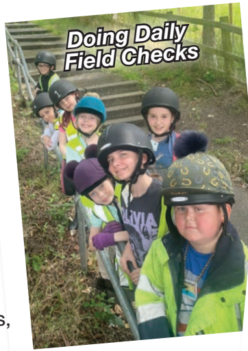
Doing Daily Field Checks