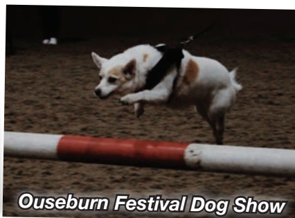
Ouseburn Festival Dog Show