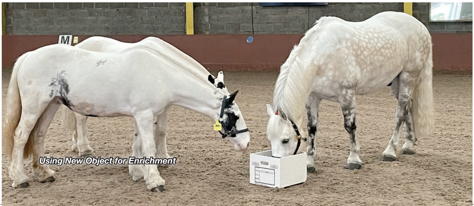
Using New Object for Enrichment

Has volunteering helped in other areas 27% no, 73% yes.