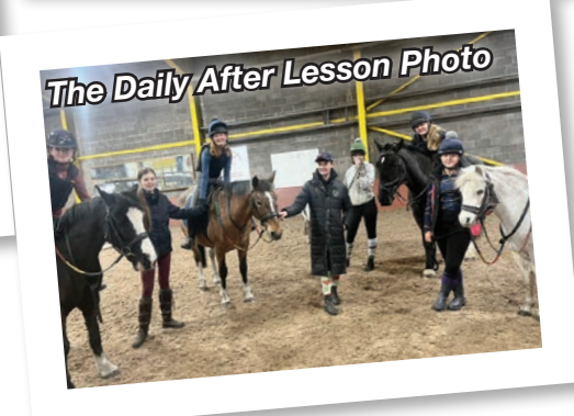
The Daily After Lesson Photo

“ My daughter is 13 and has been coming to Stepney regularly for about 5 years. She volunteers, rides, is on the youth committee, goes on trips and has even earned her BHS stage 1 qualification thanks to Stepney. Not only has she found a passion which keeps her fit, but she has learned responsibility, discipline, and the importance of working as part of a team. When the crowdfunder was launched I realised that her not having the stables any more was unthinkable and it brought home what a huge and positive part of her life it is. The staff show amazing commitment and dedication to inspiring the kids who come here and to caring for the horses and I'm proud that we're part of this lovely community. ” Parent of a Young Volunteer