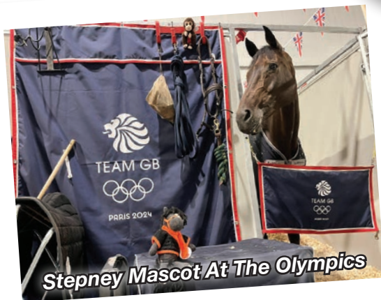
Stepney Mascot At The Olympics