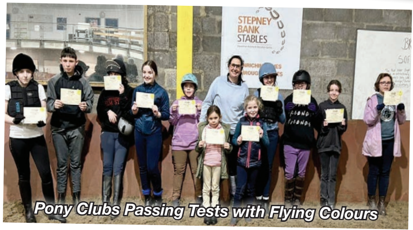
Pony Clubs Passing Tests with Flying Colours