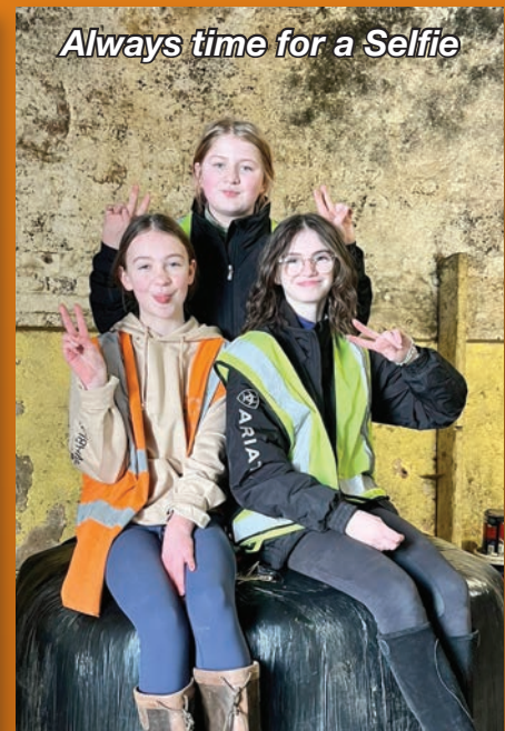
Always time for a Selfie