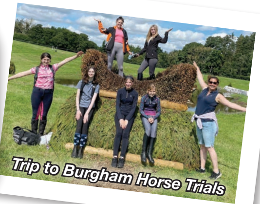
Trip to Burgham Horse Trials