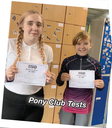
Pony Club Tests