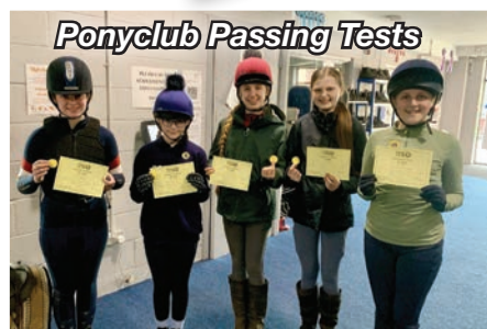
Ponyclub Passing Tests