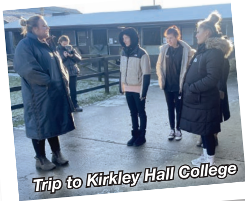
Trip to Kirkley Hall College