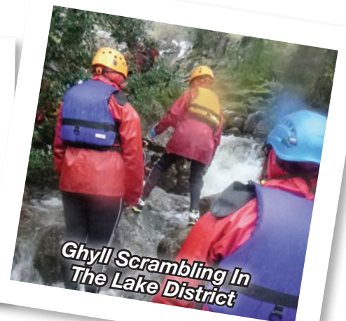
Ghyll Scrambling In The Lake District