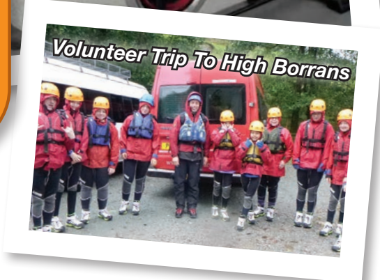
Volunteer Trip To High Borrans