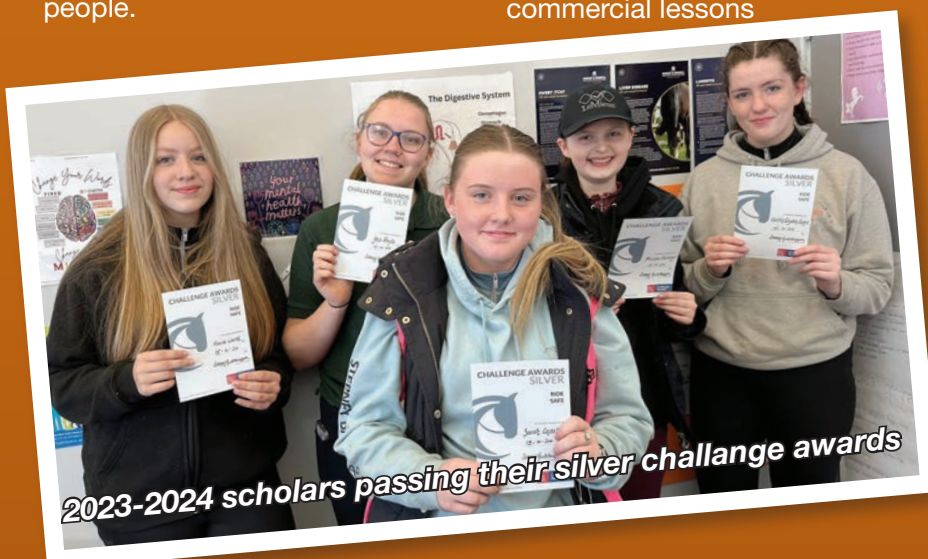
2023-2024 scholars passing their silver challenge awards

Anyway, I am as excited as ever for the future at Stepney, as we have even more great plans ahead, and hope you find our report informative & enjoyable.