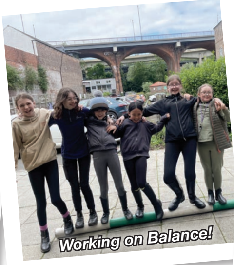
Working on Balance!