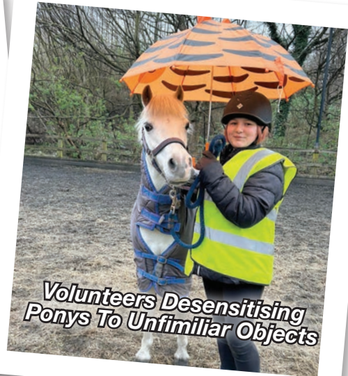
Volunteers Desensitising Ponys To Unfamiliar Objects